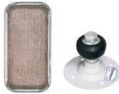
AIR PAD / EVASSER